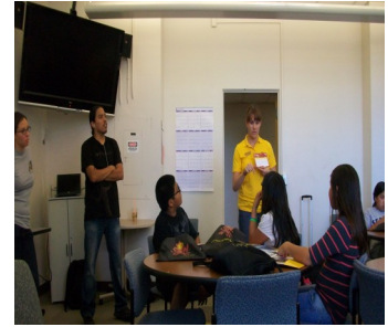
Milenio After school club takes a trip to ASU Tempe Campus

We toured ASU and saw the Native American study rooms, the Science building with the Mars Rover, and